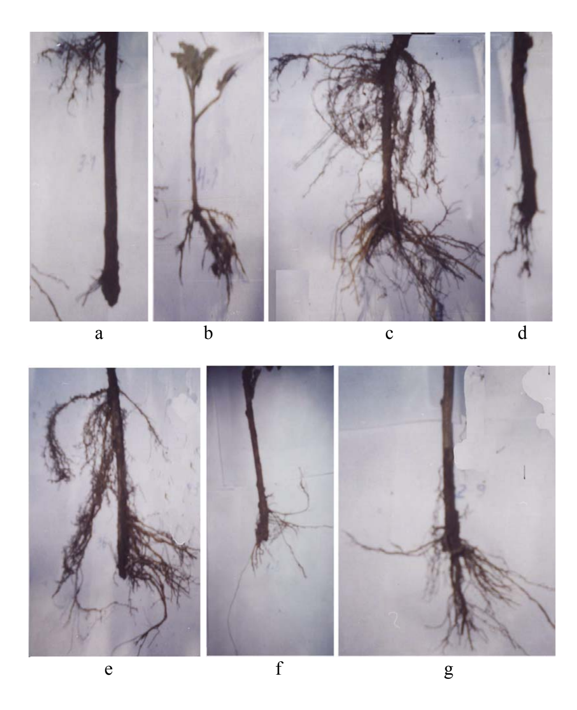
Fig. 1. Peculiarities of formation of rooting system of Ribes atropurpureum hardwood cuttings after treatment with growth regulators: a - control, H<sub>2</sub>O, b – 0.5% humat potassium, c - 1% humat potassium, d - 1% silk; e – 0.5% tellura-bio; f – 0.5% phoenix; g - 1% phoenix.