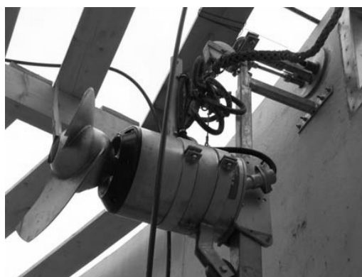
Fig. 4. Stirring device with diving-engine (faster).