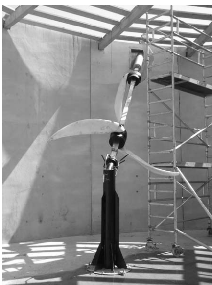
Fig. 3. Stirring device with long shaft (slow).

If the installed stirring device power is too low, mixing times are extended and increase current consumption. Also important are the slow-running stirring device with long shaft (Fig. 3) or diving-engine (Fig. 4) stirring devices, the heights and angle setting, the type, quality and dry substance content of the used substrates. Frequent damages in stirring devices are caused by the penetration of humidity into the engine space of the diving-engine stirring devices. A strong layer formation in the fermenter can cause higher resistance. This can lead to a fracture in the propellor or to a bending of the shaft. Corrosion can cause other damages in the bearings. Damages can be reduced as the operator manages the substrate composition, as well as by planning the size of the fermenter, type of the substrate, form, position and corresponding power of the stirring devices.