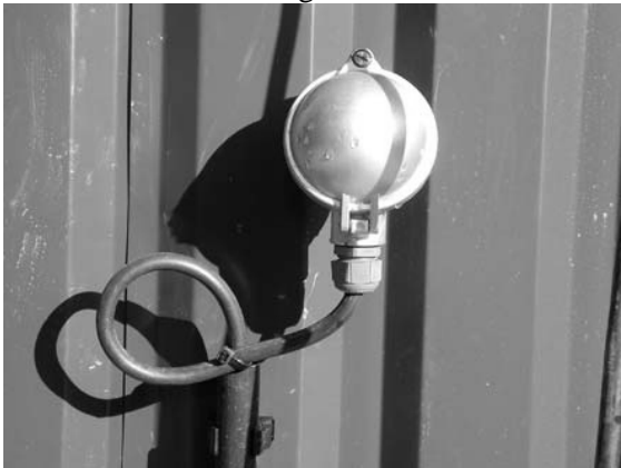
Fig. 6. Temperature detector.

Measuring and control technology: To achieve successful practice of a biogas plant in the long term, the fermenting process must be continuously controlled so that the active micro-organism groups in the fermenter find good environmental conditions and a balance forms in the fermenter. Only few plants are satisfactorily equipped with measuring technology for supervision of the process. But parameters such as mass of supplied substrates, fermenting temperature (Fig. 6), pH factor, dwell time, space load, biogas amount and composition, ammonium concentration and short-chained fatty acids should be controlled regularly. If the dwell time of the substrate in the fermenter is too short, methane bacteria can leach because of methane's longer generation time. As a result of this process the dismantling speed diminishes (Grepmeier, 2002). Thus disturbances can be recognised in the fermentation process and countermeasures can be initiated. In addition, the kinds, time and frequency of the substrate input can be recorded. If a substrate dosing engine exists, the engine can weigh the substrate. If liquid components are supplied to the fermenter, the capture of this biomass occurs with the flow measuring instruments which work electronically.