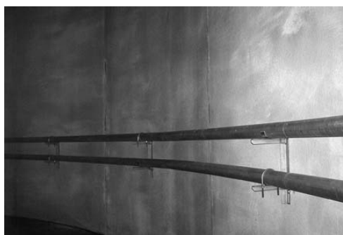
Fig. 5. Fermenter heating tubes.