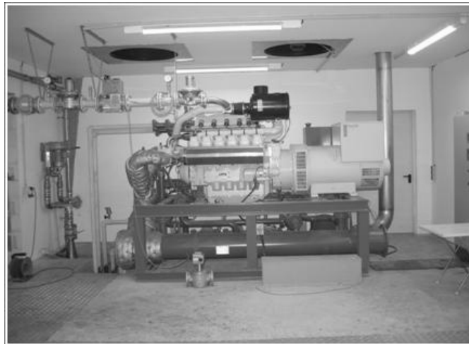
Fig. 1. Block-type thermal power station.

Block-type thermal power stations (Fig. 1): A significant problem is maintaining a full workload. In many block-type thermal power stations producing biogas, the middle workload amounts to only 5500 to 6000 full load hours per year: 8000 hours per year represents optimal efficiency (Schlegel et al., 2007). So the engines should have good efficiency for the partial load (Krautkremer, 2007). Poor efficiency results