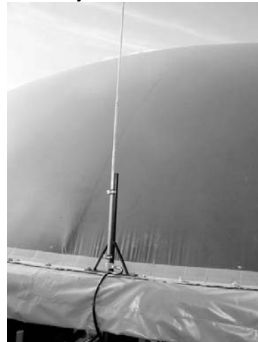
Fig. 7. Flash protection at the foil cap.

Foil caps: During the operation gas mixtures capable of explosion exist in the gas space of the fermenting chamber. Sparking is to be avoided. The stirring device should be worked beneath the surface. Additionally, a flash protection device (Fig.7) should be installed close to the foil cap.