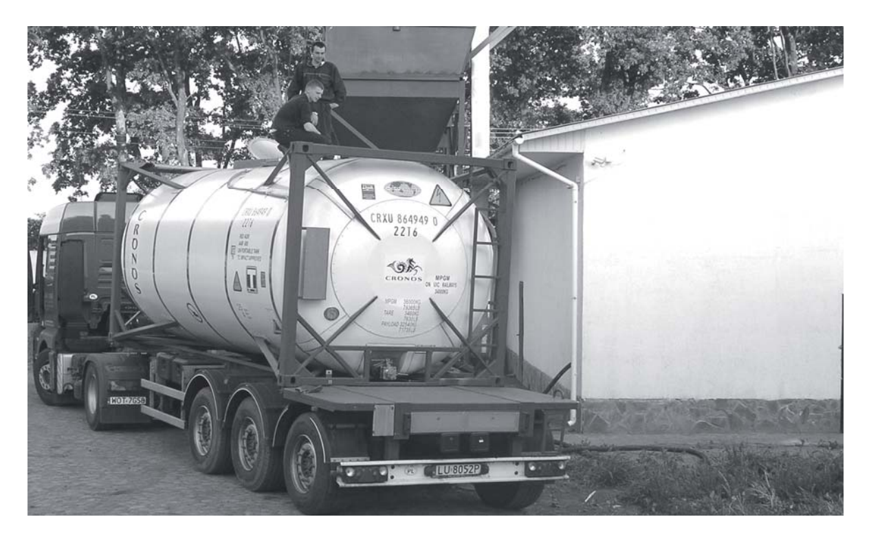
Fig. 3. A pilot plant for methyl ether production from oil seeds.

manufacturing methyl ether from rape and for the production of other oil seeds amounting to 1,000 tons per year (Fig. 3).