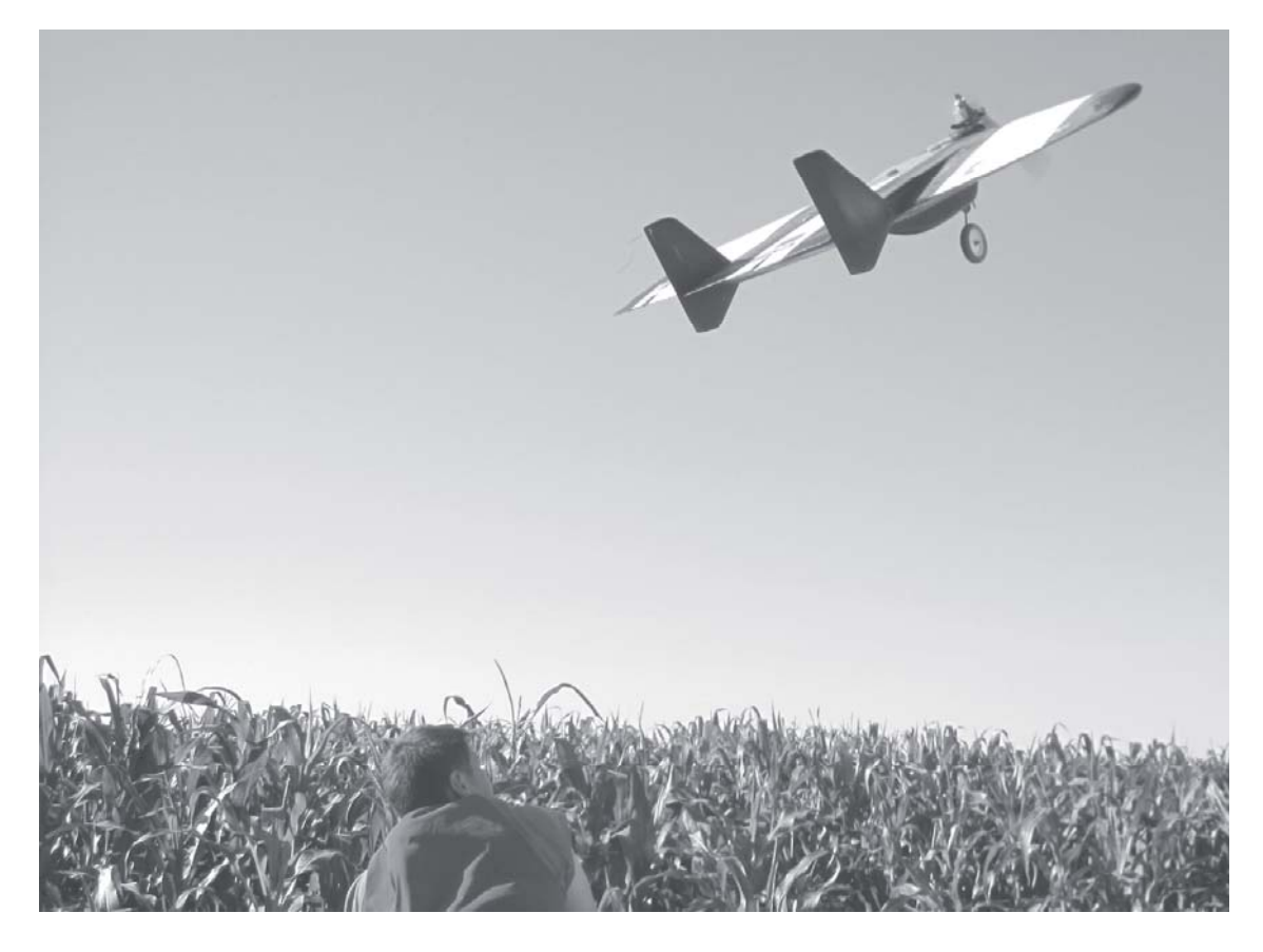
Fig. 1. The use of Trichogramma insects for corn protection during plant growth.

Taking into account the impact of chemical pest control on farm production and using integral methods of plant control gain more and more ground [4, 5]. Introduction of biological methods of plant protection together with the chemical ones for grain crops will enable to reduce the market production cost by ca 30%. Ecological and biotechnological possibilities of biomass production for energetic purposes are a new way in the development of technologies in rural areas. The modern technology for growing and processing energy plants is based on multistep quality management. The production of special equipment at industrial enterprises seems to be the most promising strategy for the development of the same modern biotechnologies. One of the positive results in our practice was the use of biological methods for plant protection (Fig. 1).