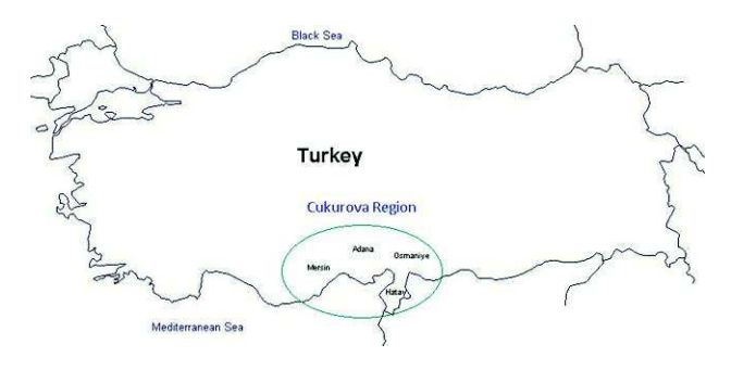
Figure 1. The study area, Cukurova region, is located on the mid-south of Turkey.

The study was conducted in the Cukurova region of Turkey including four provinces (Hatay, Osmaniye, Adana and Mersin) based on interview questionnaire. Cukurova region is located on the mid-south of Turkey (Fig. 1) and is one of the important agricultural areas in Turkey. The total area of the region is 38,509 km<sup>2</sup> as the area of cropping land is 1,091,000 ha with 421,000 ha irrigated and it accounts for 5% of the total cultivation area of Turkey (Akcaoz & Ozkan, 2005). Most important crops include cereals, cotton, corn, soybean, peanut, sunflower, olives, citrus, vegetables, fruits and medicinal and aromatic plants. The region has a typical Mediterranean climate having warm and rainy winters and hot, humid and dry summers. Farmers in this region tend to use new agricultural practices and cultivars in their production as the use of agricultural inputs has risen very rapidly and yields of crops such as wheat, cotton and maize are in an increasing trend (Akcaoz & Ozkan, 2005).