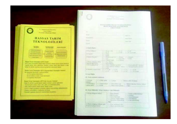
Figure 2. Training brochure (left) and questionnaire (right) used in the study.

In addition, a four-page training brochure was prepared along with the questionnaire (Fig. 2). A copy of the brochure was given to each participant after the survey and PA technologies were explained in a short face-to-face training session (about 5 to 10 minutes for each participant).