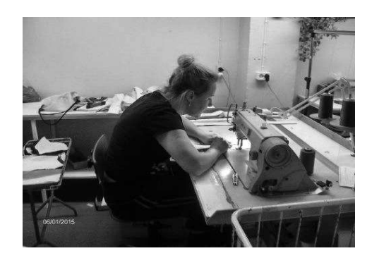
Figure 5. Workstation (universal machine) with continuous static spine curve.