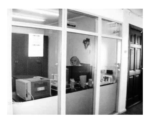
Figure 2. Office room without natural lighting.