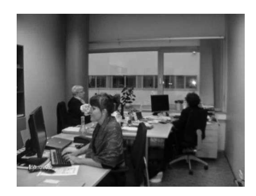
Figure 3. Office room in atrium-type building.

The workplaces depicted in Fig. 4 (gore machine) and Fig. 5 (universal sewing machine) are from the garment industry. Working with the core machine, the right hand of the worker is moving up and down hundreds of times during the workday. The right hand is under big stress. The factory has been looking for better work solutions for a long time, but there is no other machine available. Working by the universal sewing machine, the worker is working in the forced position for 8 hours a day (excluding the rest periods, 10 minutes per hour, and the lunch break). The static posture over a long period of time is a clear risk factor for developing MSDs in the neck, upper or lower back.