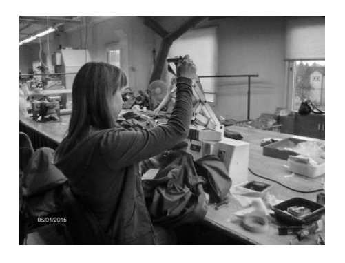
Figure 4. Workstation (gore machine) with sewing continuous one-sided dynamic movement.

The workplaces depicted in Fig. 4 (gore machine) and Fig. 5 (universal sewing machine) are from the garment industry. Working with the core machine, the right hand of the worker is moving up and down hundreds of times during the workday. The right hand is under big stress. The factory has been looking for better work solutions for a long time, but there is no other machine available. Working by the universal sewing machine, the worker is working in the forced position for 8 hours a day (excluding the rest periods, 10 minutes per hour, and the lunch break). The static posture over a long period of time is a clear risk factor for developing MSDs in the neck, upper or lower back.