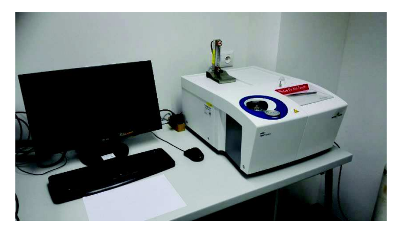
Figure 1. Mettler Toledo DSC unit.

Differential scanning calorimetry (DSC) was carried out on a Mettler Toledo DSC unit (Fig 1). Samples with a weight of between 8–13 mg were hermetically sealed in aluminium crucibles and thermally treated at a speed of heating of 2K min<sup>-1</sup> within a temperature range of 20 °C and minus 60 °C. The measurement was carried out in an ordinary air atmosphere. As a result we got a DSC thermogram, which was evaluated using STAR<sup>e</sup> software.