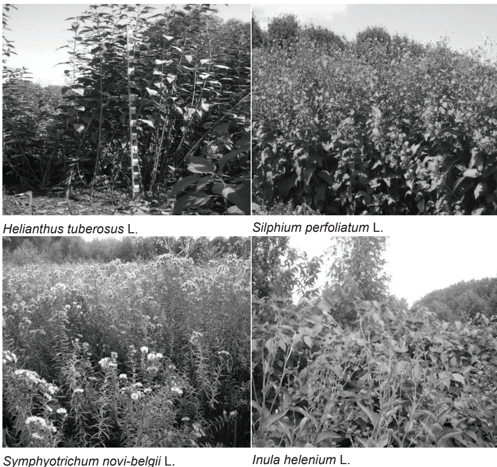
Figure 1. Perennial energy crops from the family Asteraceae .

Aboveground biomass of the selected energy crops grown for research purposes was harvested in 2012 and the further measurements of biomass and biofuels properties were performed in the Laboratory of solid biofuel of the State Agrarian University of Moldova in accordance with European Union standards for solid biofuel, which were approved and came into force in the Republic of Moldova since 2012.