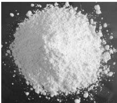
Figure 1. Alumina trihydrate.

influences the morphological properties of the casting dispersion. If the product is a simple slab the filler content can be as much as 66–92 wt% (DuPont, 2008; 2009). When casting products like washbasins or bathtubs the filler content is usually around 55–62% (Cook Composites & Polymers, 2009). The filler content is lower because the casting dispersion has to have better flow characteristics to overcome narrow openings. The filler content influences the shrinkage of the product as well. More filler means less shrinkage and residual stress (Katz & Milewski, 1987).