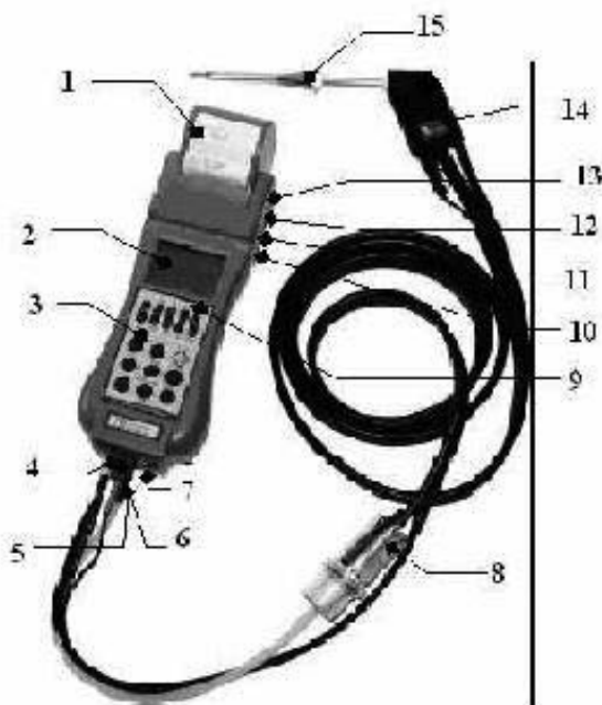
Figure 3. Flue Gas Analyzer UniGas 4000 components: 1 – impact printer; 2 – LCD display; 3 – keyboard; 4 – P1 draft pressure input; 5 – INLET flue gas input; 6 – gas temperature input; 7 – P2- \Delta P input; 8 – water trap and line filter; 9 – back light sensor; 10 – T air probe sensor; 11 – battery charger; 12 – other external probe input; 13 – infrared wave interface; 14 – emissions sampling; 15 – a stable sampling position lock.

Harmful emissions were measured by the flue gas analyzer ‘UniGas 4000’, made by the Italian company Eurotron (Fig. 3). The harmful emissions of CO, SO 2 , NO, and NO x were measured. The values of permissible emissions were regulated by standards (Jasinskas & Scholz, 2008; Žaltauskas, 2002).