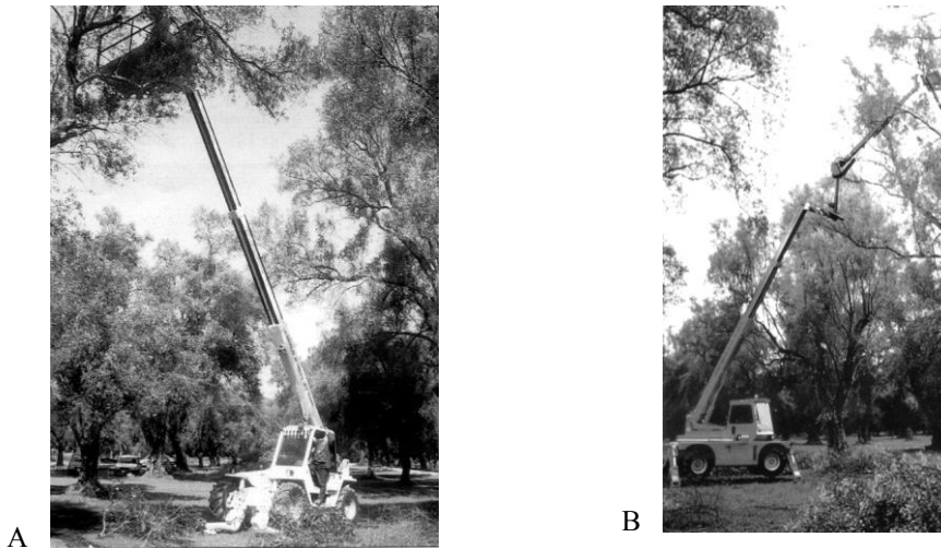
Figures 2. Telescopes arms used in the yard A (left) and in the yard B (right) in full extended position.

In yard A, the machine proceeded along the inter-row, stopping next to each tree; the pruner performed the cut in the explorable part of the crown (about 50%). The pruning was completed with the passage of the machine in the inter-row next to each tree.