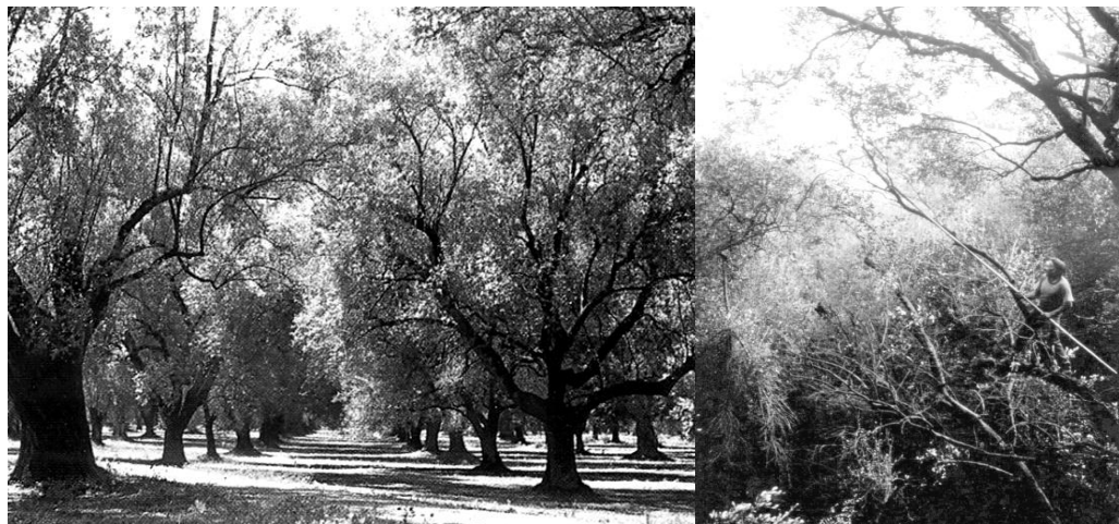
Figure 1. Typical olive-grove in 'Gioia Tauro Plain' and an example of traditional pruning.

ground) and 4 or 6 pruner specialists (2 per tree). In the farm tested, the yard consisted of seven work units (1 + 6), working simultaneously on three trees.