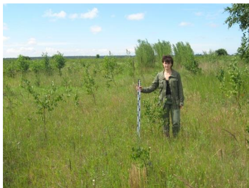
Mārupe (2005–2008)

The second experimental plot was established on agricultural land in the central part of Latvia – Skrīveri (56°41 N and 25°08 E) in the late spring of 2011. The type of soil in Skrīveri is classified as Phaeozems/ Stagnosols with dominant loam (at 0–20 cm depth) and sandy loam (at 20–80 cm depth) soil texture.