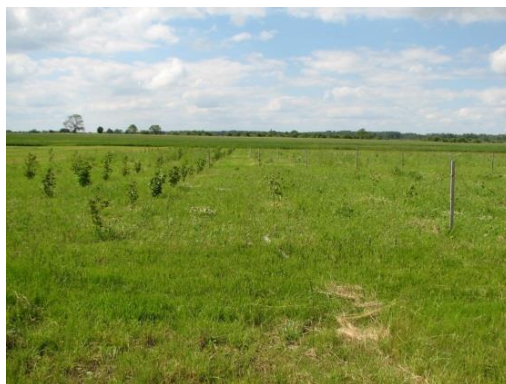
Skrīveri (2011–2012)