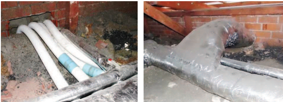
Figure 2. Air ducts coming from the facade into the attic (without insulation and already insulated).

The horizontal duct parts are made of flexible plastic duct Flat 51 51 \times 138 mm. These ducts integrated into the facade insulation so that there is at least 50 mm of thermal insulation between the duct and outdoor air. The supply air stream rate is lower than 1.5 \text{ m s}^{-1} . The plastic input unit is industrially manufactured with the diameter of 125 mm. The air ducts meet the increased requirements for air density class according to the standard EN 60529, the mechanical perimeter strength of more than 8 \text{ kN m}^{-2} , and high hygiene requirements. The special constant flow valves installed in the distribution lines placed in the attic control the supply of airflow in each room. Each air duct ( \text{Ø}75 mm) has its own flow valve.