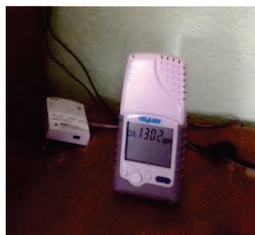
Figure 4. CO 2 sensor Telaire 7001 and data logger Hobo placed in a second floor apartment, 11 Zirnu Street.

The standard efficiency of the extracted ventilation air heat recovery will be established. Electricity consumption for whole system and for preheating will be determined.