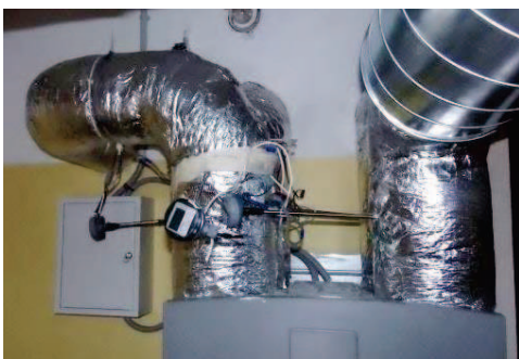
Figure 3. Placement of the combined airflow and temperature transmitter.

To compare indoor air quality, humidity, indoor temperature and CO 2 concentration are measured in two apartments of each building – one with a mechanical ventilation system and one without. For the measurements, the CO 2 sensors Telaire 7001 equipped with the data loggers Hobo (see Fig. 4), which record data about temperature, CO 2 concentration and humidity level with a 5 min interval, are used.