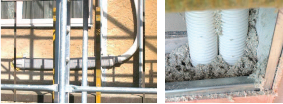
Figure 1. Air ducts are mounted into the facade’s insulation layer, enter the living room through the wall directly behind the heating radiators.