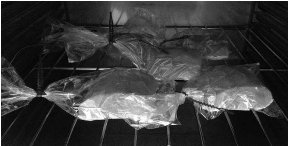
Figure 1. Sealed bags with meat chops in a preheated oven.

temperature and stored in a refrigerator at 4 °C. The pH, colour, electrical conductivity and shear force of the cooked meat samples were measured after being cooled to room temperature.