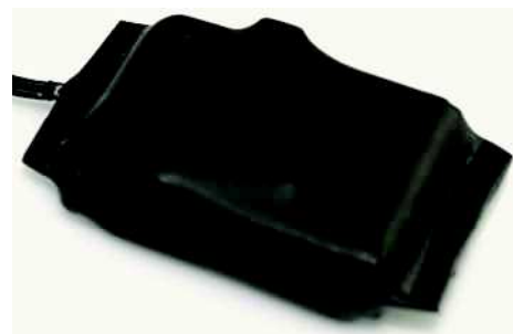
Figure 2. Miniaturized transmitter.

Once this system is fully functional, during practical use it will not be necessary to limit to the use of four receivers, but it will be possible to freely expand it according to the requirements of the end customer. Logically, the larger the area that must be guarded, the more receivers will be needed.