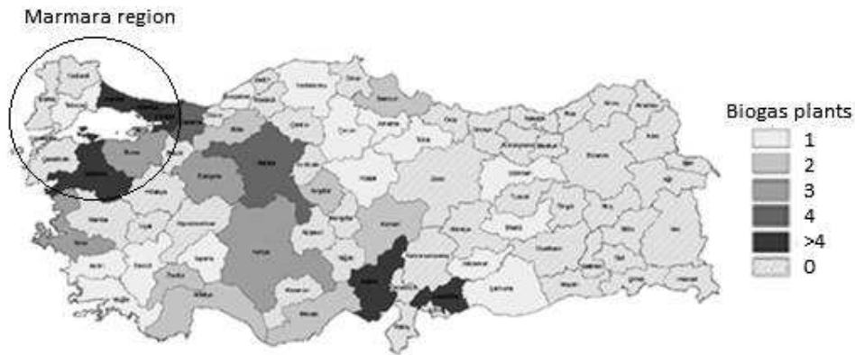
Figure 3. Number of biogas plants in the provinces of Turkey.

Although the exact number of biogas facilities in Turkey is not known, based on the project titled ‘Source Efficiency Of Animal Wastes Through Biogas And Its Climate Friendly Usage Project’ the number of active biogas facilities was 36 in 2011 and the projected biogas facilities were 49 (DBZF, 2011). Even though more investments are made in Marmara region compared to the rest of the country, limited investments were made to benefit from biogas in the region (Fig 3). The main reason for this was related to the lack of appropriate incentives for biogas production. Since the theoretical biogas potential cannot be put into production, some realistic proportions of the theoretical potential should be targeted. As shown in Table 4, significant amount of electrical energy could be produced even with the 25% of the theoretical biogas potential.