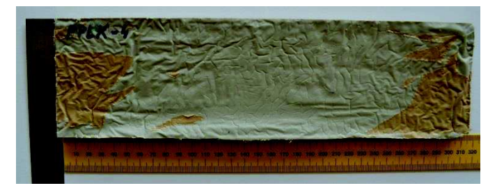
Figure 1. A composite polypropylene-perforated steel material – plane element.

In current experimental research, the composite material was produced by means of hot pressing process, using steel parts made of steel tape PST-4 sample (Fig. 1).