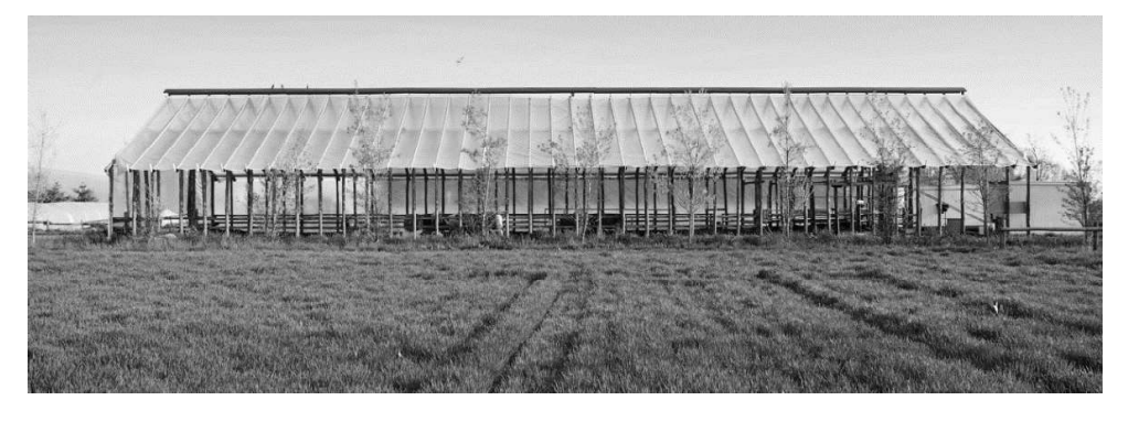
Figure 1. External view of the prototype building used for test.

In 2014, Cascina Bianca built a prototype building in order to test the feasibility of the project and measure effects on animal welfare (Fig. 1). The prototype building has been realized employing the same techniques and materials described below and can therefore provide useful indications about the performance of the housing system. The prototype building was 10 m wide and 40 m long with a total covered area of 400 m<sup>2</sup>, of which 340 m<sup>2</sup> were bedded.