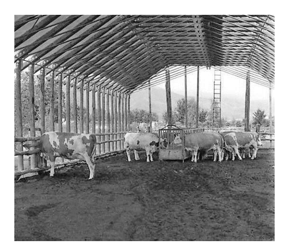
Figure 2. The movable feeding trough system allows spreading the manure over the entire area of the bedded pack, without the need of a concrete alley.

To reduce as much as possible the use of concrete and steelwork, the housing system for the new barn of Cascina Bianca will consist of a unique continuous bedded area on which the cows will rest, walk and eat. Therefore, there will be no distinctions between the resting and the feeding areas. To ensure homogenous distribution of excreta over the bedded area, cows will be fed with movable feed troughs (Fig. 2). The troughs will be filled with fresh feed and moved on a new spot every day. Bedding will be 0.8 to 1.0 m-deep and the floor beneath will be realized with a plastic foil. A layer of sand will be placed above the foil to protect it even though the pack stirring operations, which will be carried out once or twice a day, will