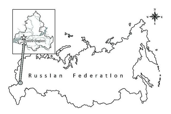
Figure 1. Location of the research region.

The soils belong to ordinary chernozems of different thickness (Voronic Chernozems, WRB), degree of leaching from carbonates and humus content (Shishov et al., 2004; Valkov et al., 2008). According to No-Till, chernozems are treated on an area of about 5 thousand hectares over the last 9 years. The territory of the Oktyabrsky district of the Rostov region is located in a region with significant thermal resources. The sum of positive air temperatures (above 10 °C) is 3,200 °C. Summers