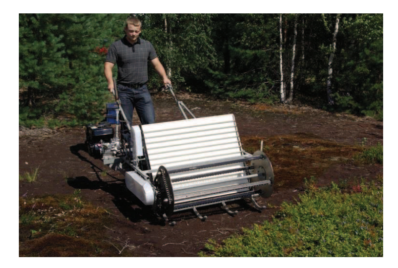
Figure 3. Prototype of the blueberry harvester.

The number of rakes depends both on the kinematics of the picking reel as well as the positioning of its shaft. During design, it would be most reasonable to choose the number of the reel rakes in the limit of z = 4...6 (Landtechnik, 1999). Following from