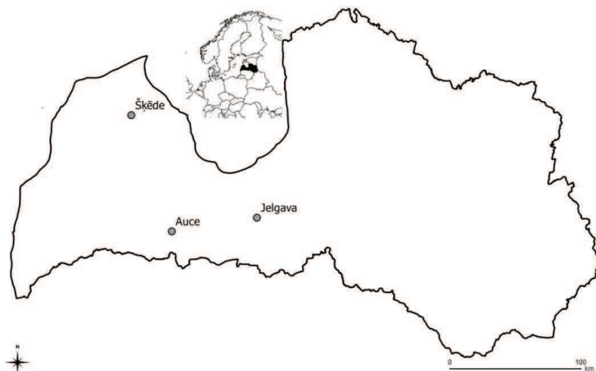
Figure 1. Locations of studied stands (forest research stations).

The initial spacing ranged from 5,000 to 7,000 trees per hectare, no commercial thinning has been done before sampling. Stand age at the sampling was 54–65 years. Diameter, height and damages were measured. Information from National Forest Inventory plots from common aspen and Norway spruce stands of the same age and forest type, from the same regions of Latvia were used for a comparison.