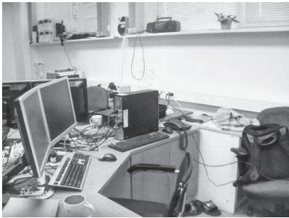
Figure 3. Office in an institution 3.