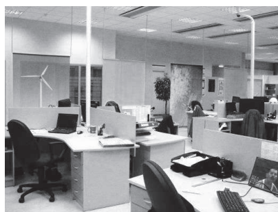
Figure 2. Office in an institution 2.