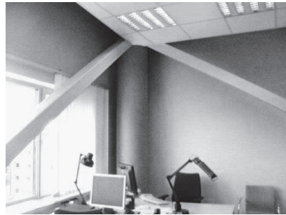
Figure 4. Office in an institution 4.