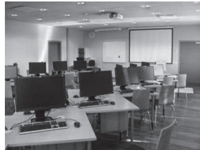
Figure 6. Computer class in a renovated school building.