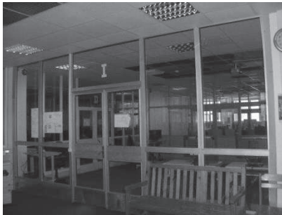
Figure 5. Computer class in an old school building.