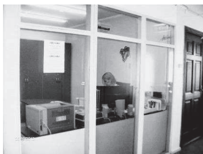
Figure 1. Office in an institution 1.

Workplace lighting and screens were measured using the light-metre TES 1332 (ranges from 1–1,500 lx). Lighting was measured on the desk, on the screen, and on the keyboard. Dust was measured with HazDust EPAM-5000.