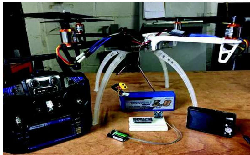
Figure 2. Low-cost RPA prototype.

* Expenses related to screws and fittings, wires, insulation tape, battery, weld and others.