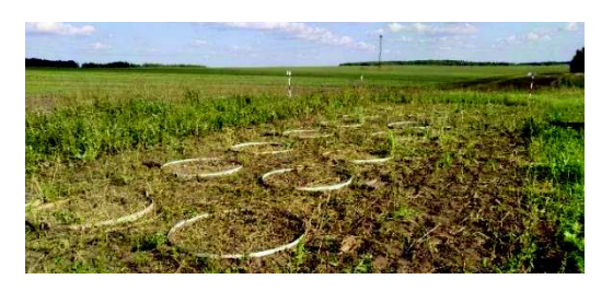
Figure 2. Lysimetric experiment on gray forest soil.

According to our research plan, the effect of copper and copper oxide nanoparticles was studied with an optimal concentration of 0.01 g hectare seed rate (Table 1). The experiment was carried out in four replicates.