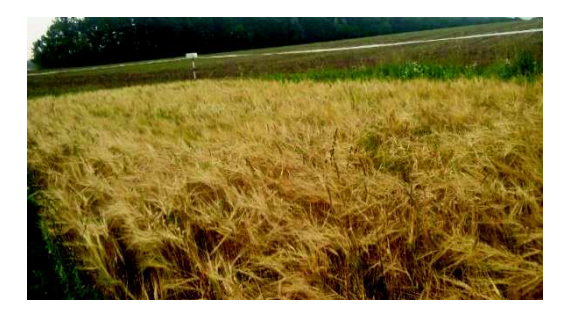
Figure 3. Spring barley variety Kati.

Barley spring variety 'Kati' was chosen as the object of research (Fig. 3). The species is nutans. The bush is intermediate. The leaf sheath of the lower leaves is without pubescence. The anthocyanin color of the flag leaf ligules is medium - strong, the wax coating on the sheath is weak medium. The plant has short - medium length. Pyramidal spike - cylindrical, loose - medium density, with medium - strong waxy coating. The awns are