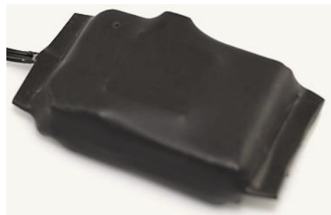
Figure 2. Miniaturized transmitter.

Once this system is fully functional, during practical use it will not be necessary to limit to the use of four receivers, but it will be possible to freely expand it according to the requirements of the end customer. Logically, the larger the area that must be guarded, the more receivers will be needed.