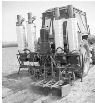
Fig. 1. Thermal weed extermination by the wet water vapour device.

For field experiments in 2005 we used the fourth version of our experimental tractor device as a mobile weed control machine using wet water vapour medium (Fig. 1). This machine was built in 2004 to facilitate investigation of the weed thermal extermination process and experience previously gathered. Investigations under laboratory and field conditions were carried out in 1997–2005 in barley, maize and onion crop fields. We carried out field experiments in the experimental station of the Lithuanian Agricultural University. Laboratory experiments were carried out in laboratories of the Agricultural, Thermal and Biotechnological Engineering departments of the University.