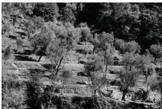
Figure 5. Ground with a high slope (plot ‘c’).

In the third test site the ground was strongly declivous, with an average gradient of 32% and the majority of the plants were disposed in terraces. The trees were reared free-form and they had an average height of the trunk of about 1.00 m (Fig. 5). In this case the orographic conditions of the ground and the difficulty of displacement of workers had not allowed to perform the harvest with no mechanical device also of portable type. Harvesting was therefore carried out only manually utilizing the wooden poles (Fig. 6).