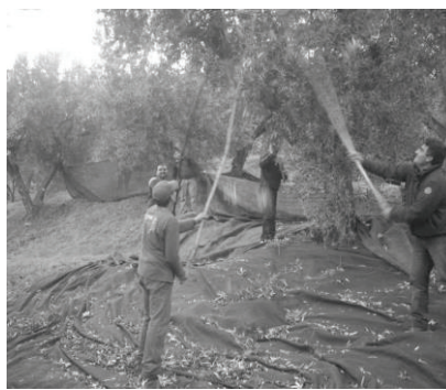
Figure 6. Manual harvesting (beating).

In this yard, once the networks were drawn under the foliage of the olive trees, three workers equipped with wooden poles started to beat the fruiting boughs. The olives have fallen into the nets were collected in crates and, after clearing them from leaves and twigs, sent directly to the oil mill.