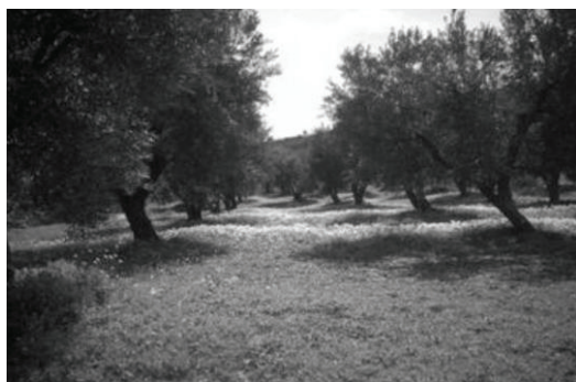
Figure 1. Plane ground (plot 'a').

The harvest was performed using self-propelled vibratory shaker (SICMA F3) wheel drive on three wheels(the singleis posterior and steering axle) hydraulic transmission. The warhead-carrying arm is telescopic and the commands for the handling of machine and the vibrations are carried out by a joystick; the vibrating head is at very high frequencies and self-braking. The engine is a supercharged 4-cylinder IVECO that packs a punch of 93 kW at 2,300 g min-motor -1 (Fig. 2).