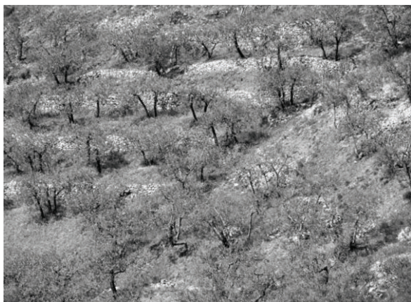
Figure 3. Declivous ground (plot 'b').

The machine used is the Cifarelli SC800 which is provided with a motor of 52 cm 3 , single-cylinder two-stroke air-cooled. The rod is of the telescopic type with variable length (from 3 to 5 m), and is provided with terminal hook. The whole device weighs about 15 kg and can produce more than 2,000 oscillations min -1 (Fig. 4).