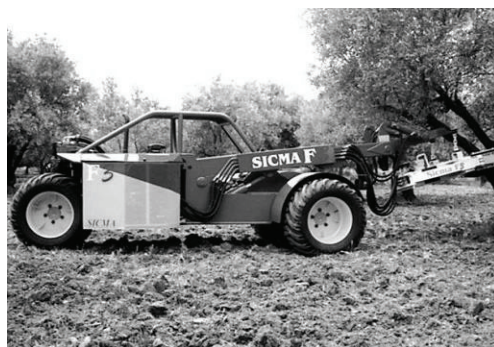
Figure 2. Mechanical harvesting.