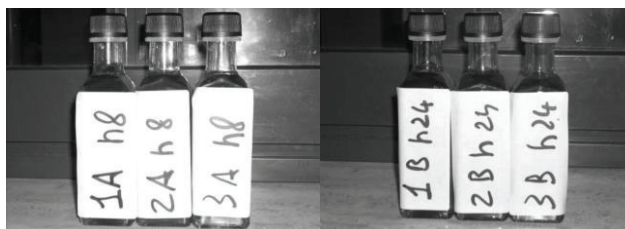
Figure 7. Some of the oil samples used for the analysis.

Each oil sample of 250 ml has been labelled according to the corresponding harvesting system and extraction time (Fig. 7) and it has been sent to an appropriated laboratory to be analyzed. The laboratory analyses are aimed at determine acidity percentage and peroxide quantity present in each sample of oil. Acidity represents a fundamental indicator for olive oil quality because it defines commodity classification. Peroxide quantity; however, indicate oxidation level of unsaturated fatty acids that provide a characteristic rancid smell to the oil, especially, if it is subject to high temperatures, light and oxygen. Less is the number of peroxide, better is olive oil quality and its shelf-life. The oxidative processes may be revealed through measurement of spectrophotometric constants: