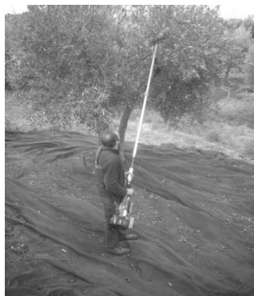
Figure 4. Facilitated harvesting.