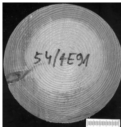
Fig. 2. Results of impregnation tests of pine roundwood with coloured rapeseed oil emulsion.