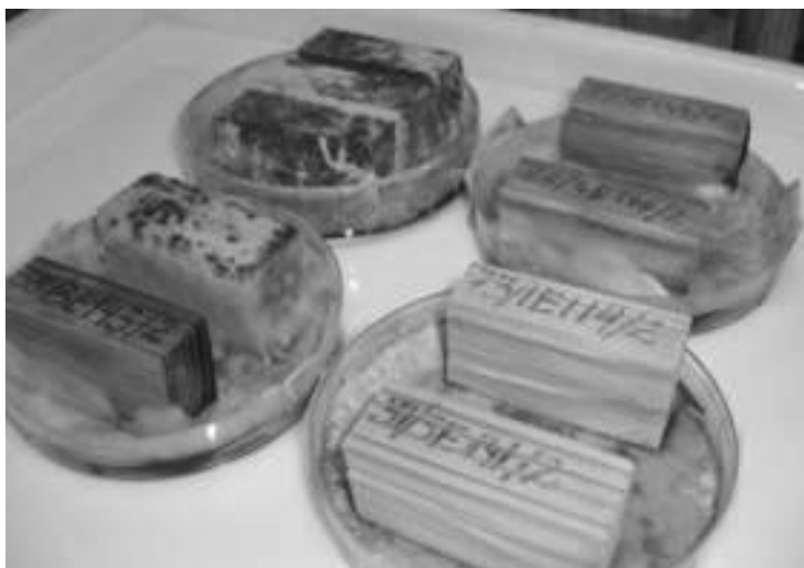
Fig. 3. Results of the biological durability test with Coniophore puteana of pine wood specimens with and without impregnation.

After leaching, the bio tests were performed to analyze the decay resistance effect of both impregnation agents (Table 4). The results of bio test study showed permanent decay resistance against fungi Coniophora puteana , Gleophyllum trabeum , Poria placenta of pine wood impregnated with rapeseed oil and boron compounds based emulsion. Tanalith E showed decreasing of fungal decay resistance in bio protection tests, which were performed after leaching of impregnation agents.