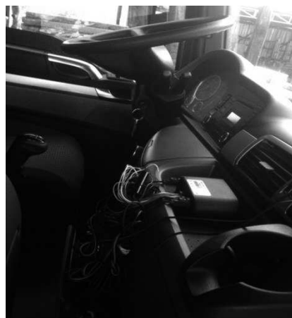
Figure 1. Installing the GPS/GSM black-box unit.

The tests were carried out at three forest sites, indicated below by the letters A, B, and C and all located in the Serre massif (VV). Table 2 gives the features and vegetation characteristics of the three test sites from surveys carried out beforehand.