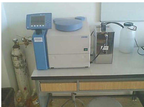
Figure 1. Calorimeter IKA C 6000 control unit (IKA® Works, Inc., USA).

Since the aim of the study was to compare pellets and briquettes produced from maize straw (residues) with regards to its physical and mechanical properties in relationship with differences in diameters. Therefore, by experimental measurements was observed calorific value and ash content as a main criterion. Various laboratory devices were employed in measurements, e.g. laboratory calorimeter control unit (Fig. 1) and laboratory combustion furnace.